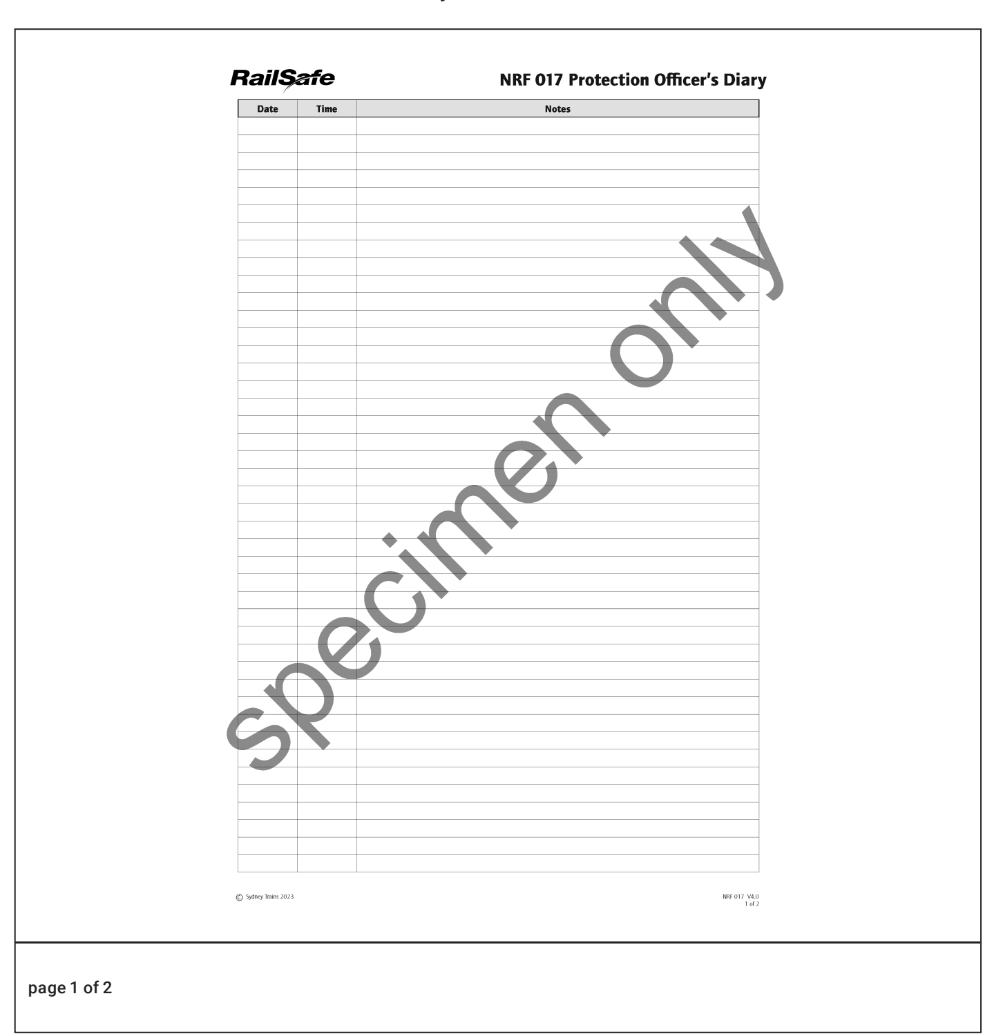
FIGURE 1: NRF 017 Protection Officer's Diary