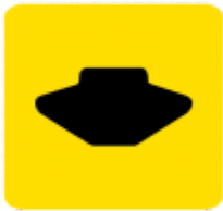
FIGURE 21: Examples of electric train STOP signs.

Located adjacent to points that can give access to a non-electrified portion of track. Drivers must not proceed if points are set for the non-electrified portion of track unless authorised to travel with pantographs lowered.