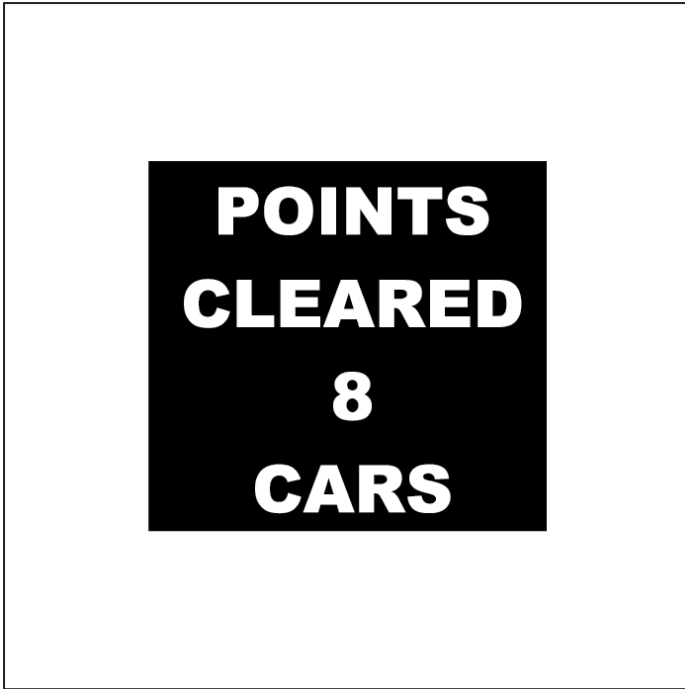
FIGURE 22: Electric train POINTS CLEARANCE sign.