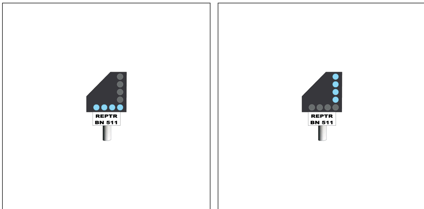
FIGURE 14: LED repeater signal indications.