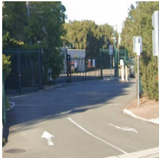
Image 1: Access gate S00 35.327 U near 8 college St carpark gate