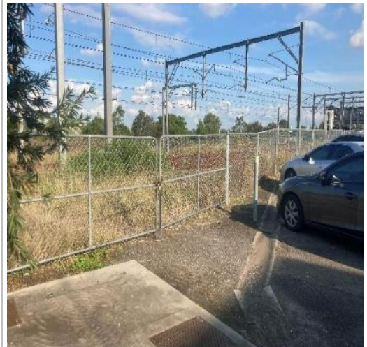
Image 2: Access gate S00 35.459 U