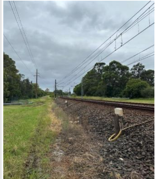
Image 4: View of worksite towards Panania station Facing the Up direction.