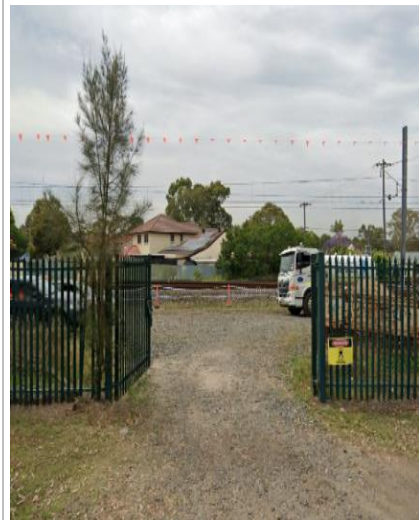
Image 6 M25 23.590U. Located on Park Road. Wider Access for trucks or larger vehicles