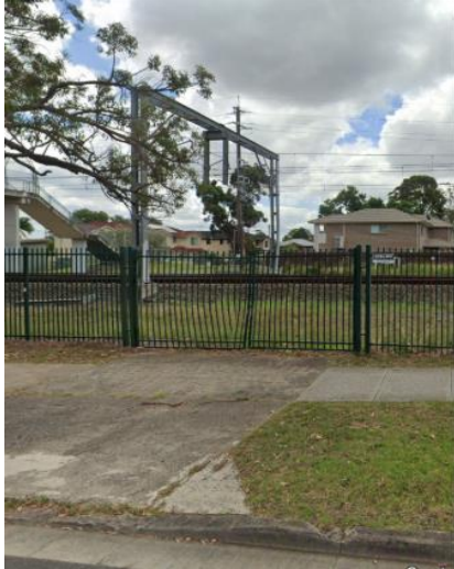
Image 7 M25 23.801D. Opposite 61 Lehn Rd. City end of East Hills.