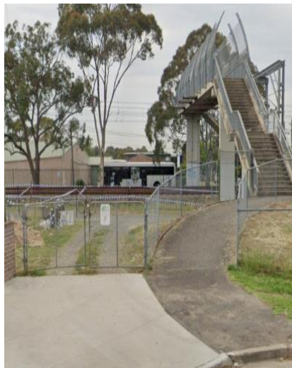
Image 5 : M25 23.827U .Gate adjacent 15 Forest Rd, Up side at the city end of East Hills Station