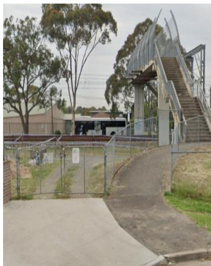
Image 5 : M25 23.827U .Gate adjacent 15 Forest Rd, Up side at the city end of East Hills Station