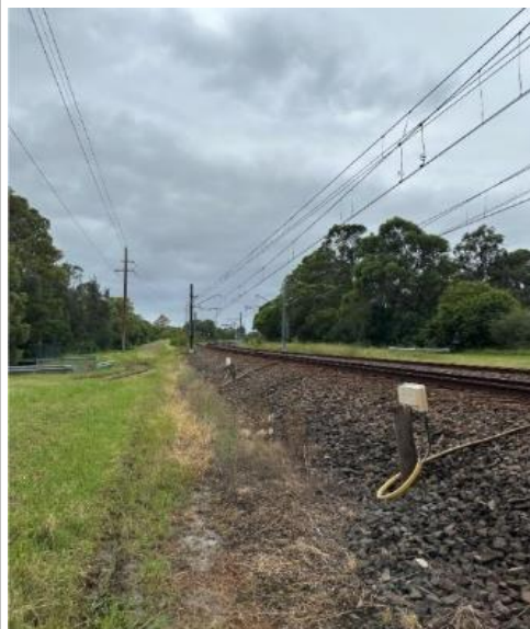
Image 4: View of worksite towards Panania station Facing the Up direction.