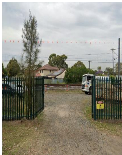
Image 6 M25 23.590U. Located on Park Road. Wider Access for trucks or larger vehicles