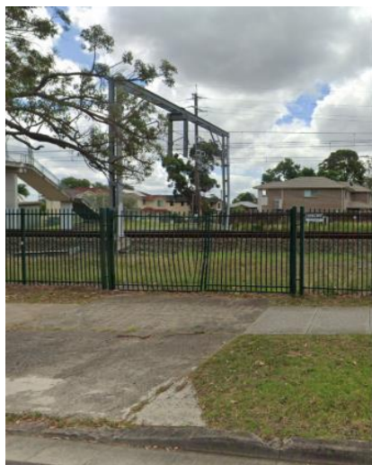
Image 7 M25 23.801D. Opposite 61 Lehn Rd. City end of East Hills.