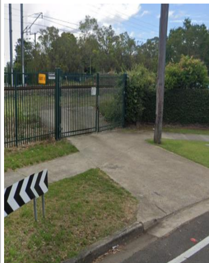
Image 8 M25 23.633D Gate on Lehn Rd on the down side city end on East Hills Station