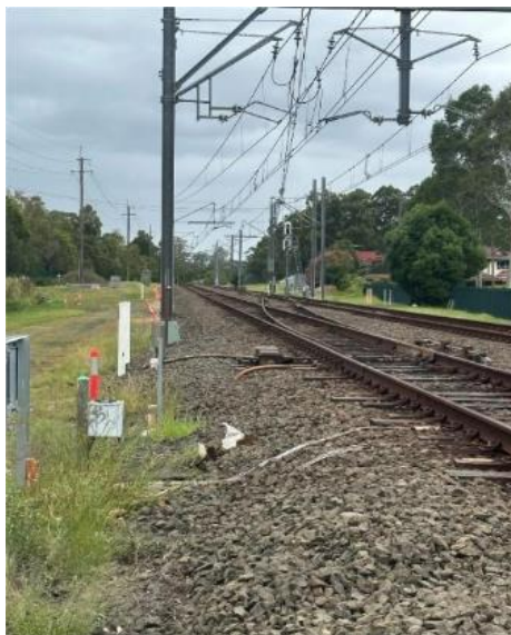
Image 3: View of worksite towards Panania station facing the Up direction.