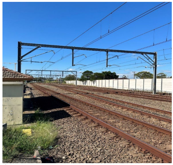
Image 4: View of worksite towards Canley Vale and Carramar stations