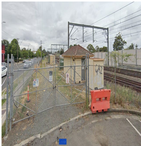
Image 1 : Access gate NO: M16 31.733 U Station carpark