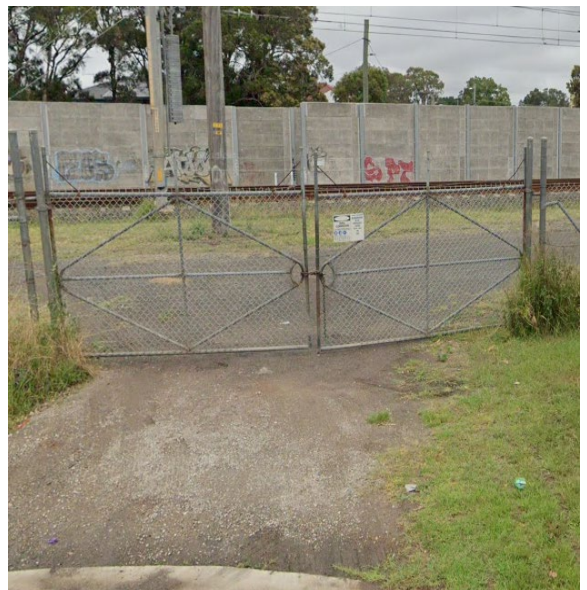
Image 2: access gate S00 27.519 U West street