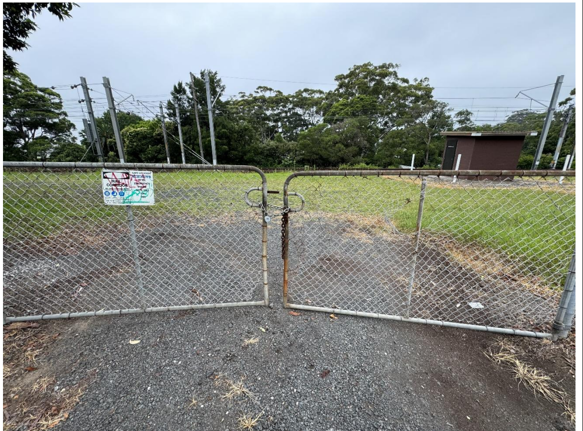
Image 5: Access Gate 100 68.376 at Austinmer on the Up side. Double Gate in the middle Railway Ave Austinmer