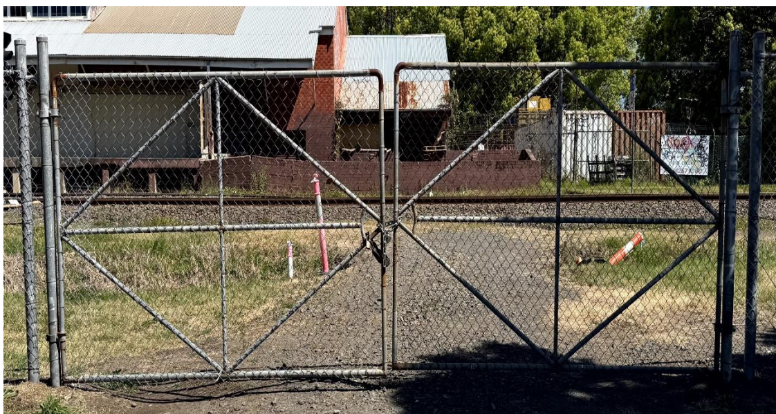
Image 1: Access gate 100 102.940 D off Burroo street.

If the ASB is required to be suspended, the Protection Officer must make sure all workers and equipment are clear of the Danger Zone and are in a safe place before suspending the ASB.