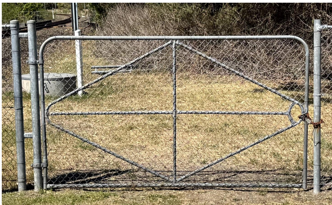
Image 3: Access gate 100 103.419 U on Princes Highway (through Commuter carpark).