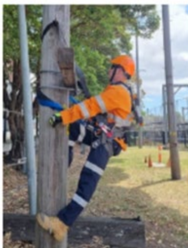
Figure 1 – Attached climbing with two pole straps

As a joint exercise, SRA, EDU and T&D have developed an alternative method to secure the rescue rope around the pole above a crossarm, thus avoiding most of the pole hardware.