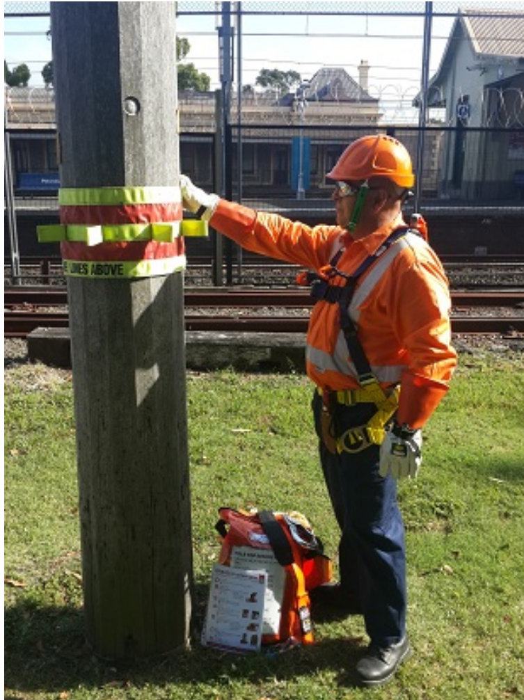
Figure 1: Accompany Person at the base of pole

When working on or passing through live low voltage conductors, an Accompanying Person shall be wearing a safety harness at all times when a worker is aloft.