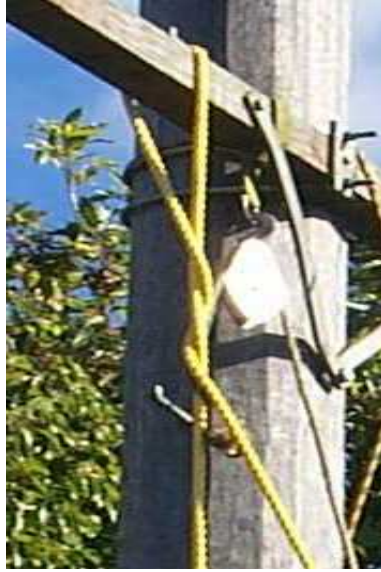
Figure 5: Rescue rope over cross arm with tail one turn around fall of rope