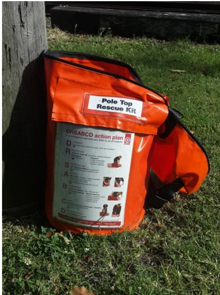
Figure 2: Pole Top Rescue Kit at bottom of pole