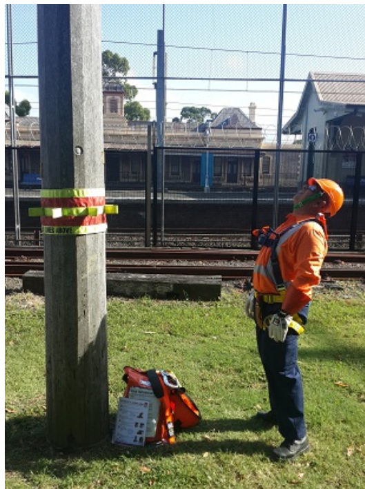
Figure 3: Accompanying Person observing with pole top rescue kit ready for use