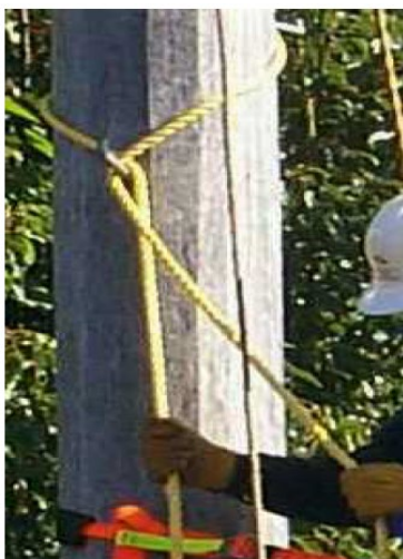
Figure 2 – Rescue rope using pole peg

NOTE: Crossarms, standoff insulators or pole raisers must not be used as the primary anchor point for the rescue rope. Always use the pole.