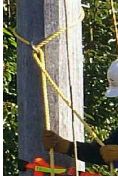
Figure 6: Rescue rope over pole step, around pole with the tail looped over first pole step