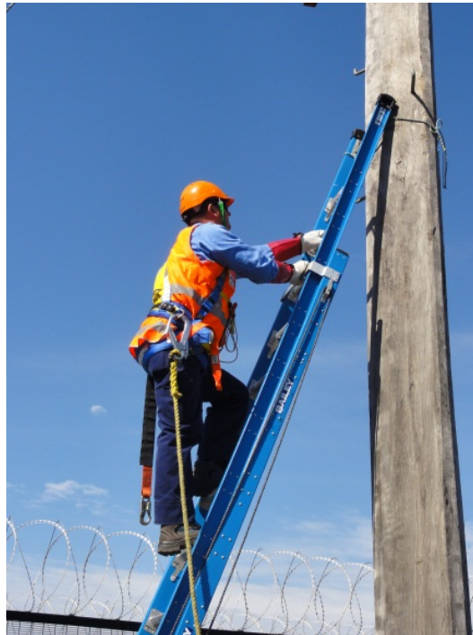
Figure 4: Accompanying Person ascending pole for rescue