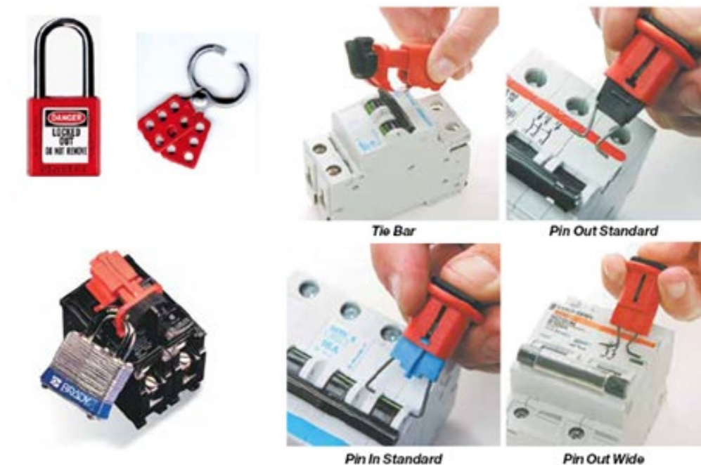
Figure 1: Examples of 'Lock Out' Kits

Figure 1 shows examples of 'Lock Out' kits that can be used where practicable for different LV applications.