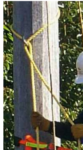
Photo 6: Rescue rope over pole step, around pole with the tail looped over first pole step