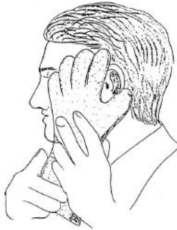
Step 3. Hold Glove To Face and Feel. Listen For Escaping Air or Immerse In Water and Watch For Bubbles.