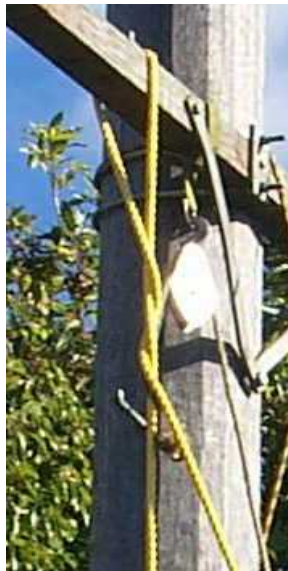
Photo 5: Rescue rope over cross arm with tail one turn around fall of rope