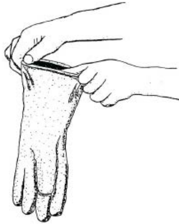
Step 1. Hold Glove Downward and Grasp Cuff.