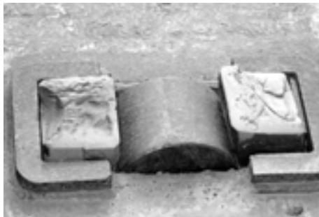
Figure 3: Constant contact side bearers with melted plastic blocks