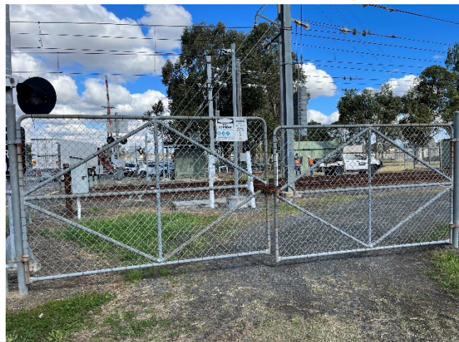
Image 2: Sensor access using access gate M17 57.302 U