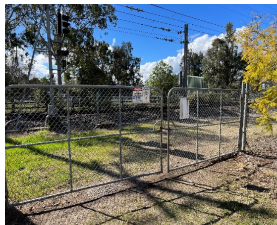
Image 2: Sensor access using access gate M17 56.910 D