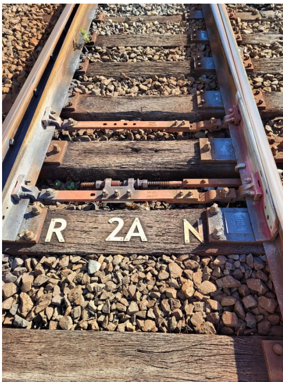
Image 3: Example of 2A points clipped and locked in the normal position to prevent rail traffic entry into the worksite.