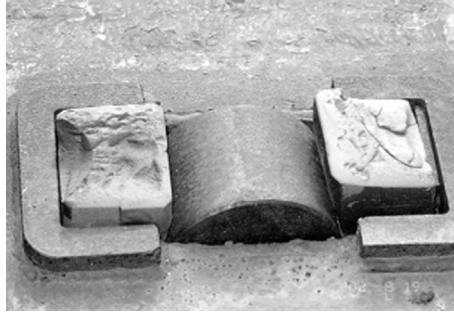
Figure 3: Constant contact side bearers with melted plastic blocks