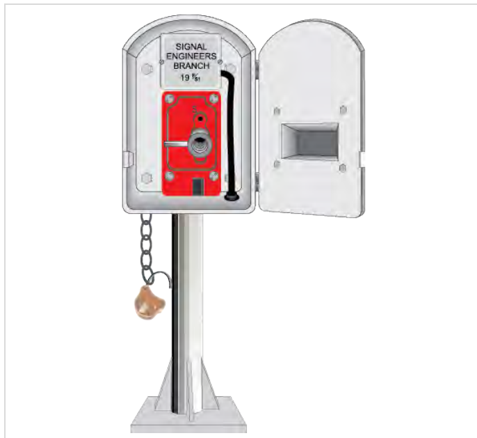
FIGURE 2: Open half-staff cabinet.