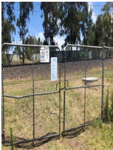
Image 1: Access Gate W00 51.306 U