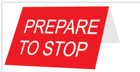
FIGURE 4: PREPARE TO STOP sign.