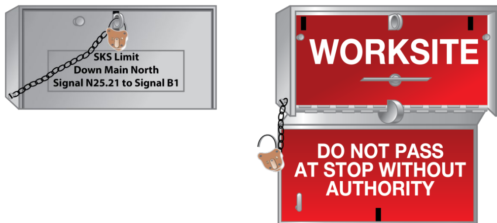
FIGURE 1: Dedicated box in the closed and open position

The key is inscribed with the identifying number of the signal and the line to which it applies.