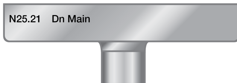
FIGURE 2: Example of key with inscribed details

The key is inscribed with the identifying number of the signal and the line to which it applies.