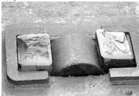
Figure 3: Constant contact side bearers with melted plastic blocks