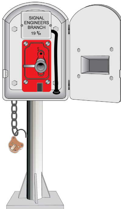
FIGURE 2: Open half-staff cabinet