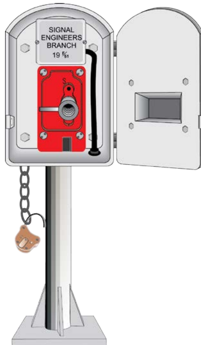
FIGURE 2: Open half-staff cabinet