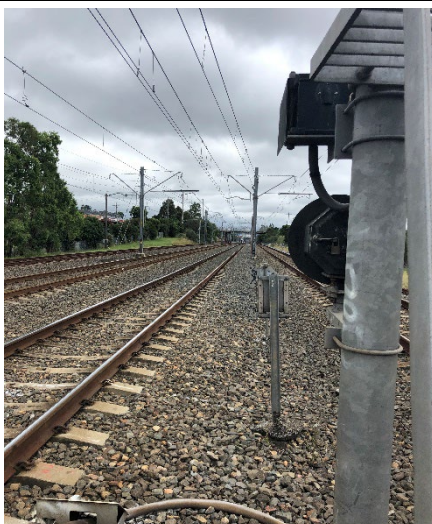
Image 3: View of Up direction Lookout at 46.696 KM 6 foot behind signal SM 454 S