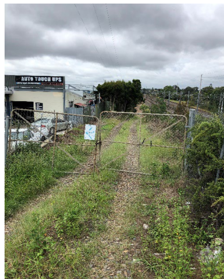
Image 3: Access/egress gate W00 46.959 U.