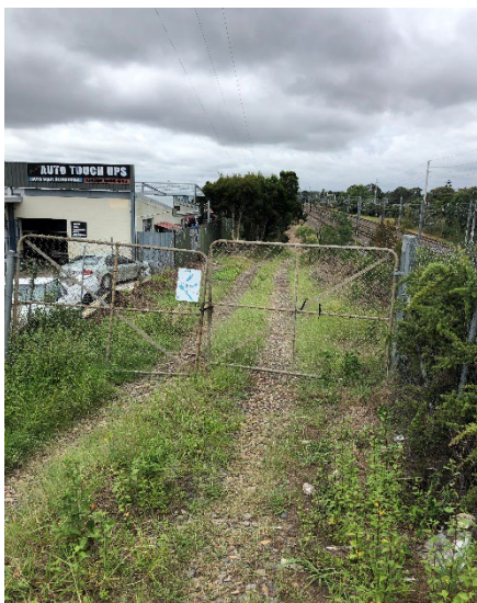
Image 3: Access/egress gate W00 46.959 U.

ACCESS / EGRESS AND EMERGENCY ASSEMBLY POINT