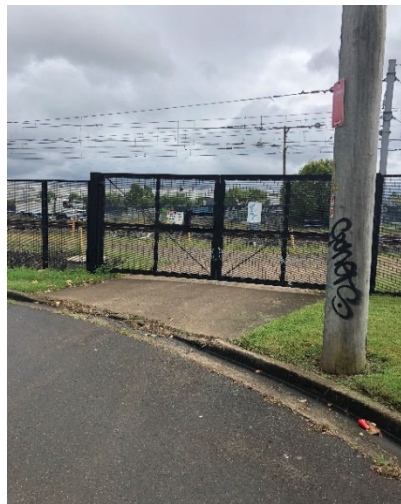
Image 3: Access/egress gate W00 47.649 D