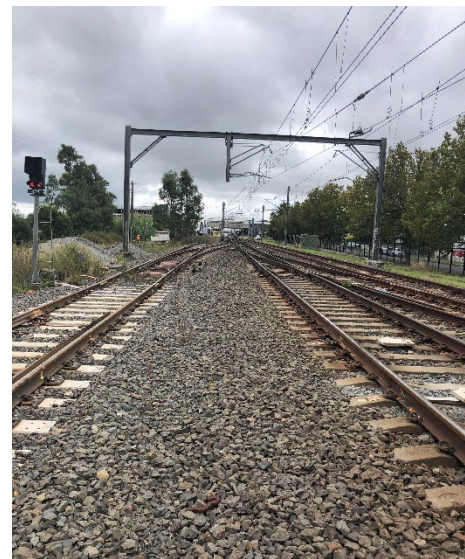
Image 2: View of Down direction Lookout at 47.850 KM in a safe place behind signal SM 480 M.