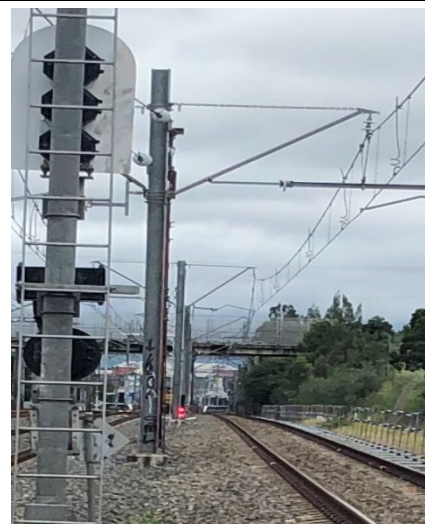
Image 4: View of Up direction Lookout at 46.696 KM 6 foot behind signal SM 454 S