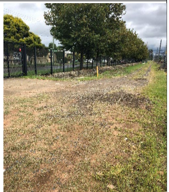
Image 4: Emergency Assembly Point inside gate W00 47.649 D