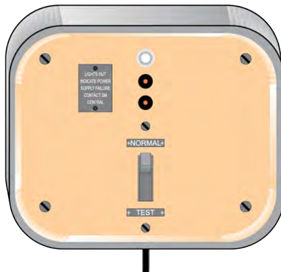
FIGURE 3: Test box

Test switch boxes have a Test switch and two lights. When the Test switch is set to TEST, it activates all warning equipment. When lit, the lights indicate that battery power is available.