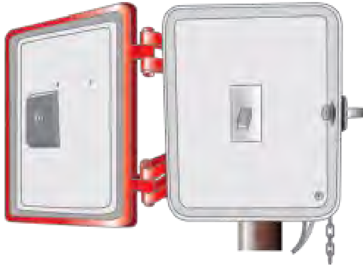
FIGURE 5: Shunter's switch

Shunters switch boxes have a two-position switch. Level crossings with shunters switches usually have a box on each side of the level crossing. When the switch is operated, it activates all warning equipment. Once activated, the crossing equipment can be deactivated by operating the shunters switch on either side of the crossing.