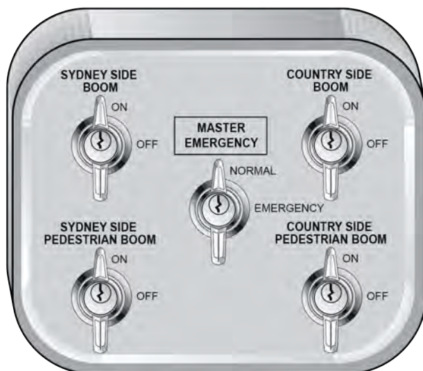
FIGURE 8: Emergency switch box with Master Emergency Switch and boom switches only. NOTE: Additional boom switches only provided if crossing is fitted with pedestrian booms