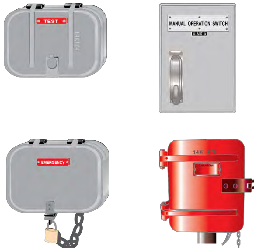
FIGURE 2: Level crossing switch boxes

Switches to control warning equipment are located in locked boxes at or near level crossings.