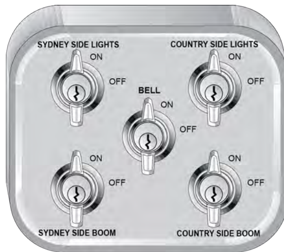
FIGURE 7: Emergency switch box with individual switches for lights, bell, and booms

One type has individual switches for Sydney and Country side lights, Sydney and Country side booms, and bell.