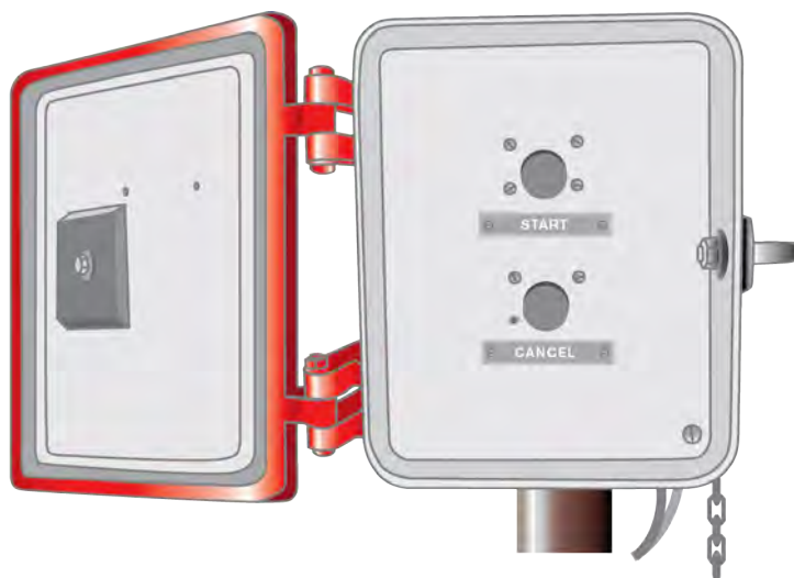
FIGURE 6: Shunters push button

Shunters push buttons are found in a box on each side of the level crossing. There are two push buttons START and CANCEL . To activate the level crossing warning equipment the START button is pressed, the equipment is automatically deactivated when the rail traffic clears the level crossing. The CANCEL button is used to deactivate the level crossing equipment if the intended movement is not made.