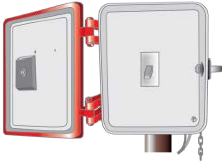
FIGURE 5: Shunters switch

Shunters switch boxes have a two position switch. Level crossings with shunters switches usually have a box on each side of the level crossing. When the switch is operated, it activates all warning equipment. Once activated, the crossing equipment can be deactivated by operating the shunters switch on either side of the crossing.