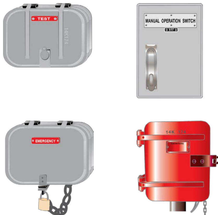
FIGURE 2: Level crossing switch boxes

Switches to control warning equipment are located in locked boxes at or near level crossings.