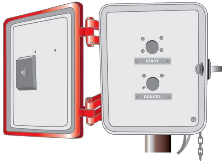
FIGURE 6: Shunters push button

Shunters push buttons are found in a box on each side of the level crossing. There are two push buttons START and CANCEL . To activate the level crossing warning equipment the START button is pressed, the equipment is automatically deactivated when the rail traffic clears the level crossing. The CANCEL button is used to deactivate the level crossing equipment if the intended movement is not made.