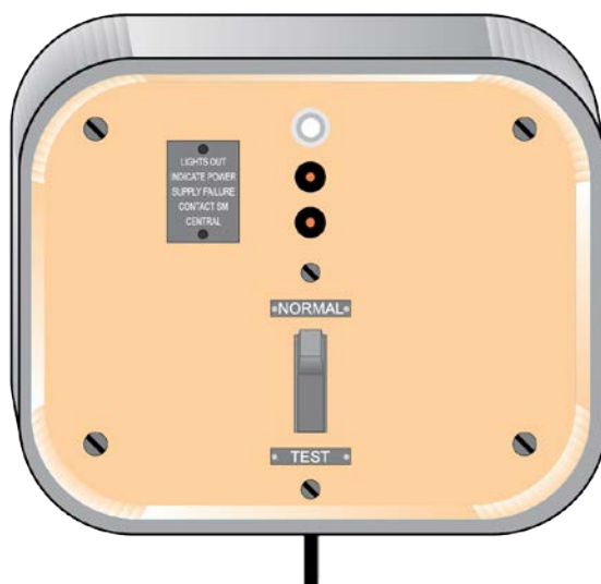
FIGURE 3: Test box

Test switch boxes have a Test switch and two lights. When the Test switch is set to TEST, it activates all warning equipment. When lit, the lights indicate that battery power is available.