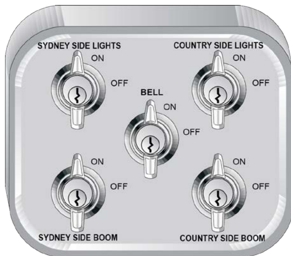
FIGURE 7: Emergency switch box with individual switches for lights, bell and booms