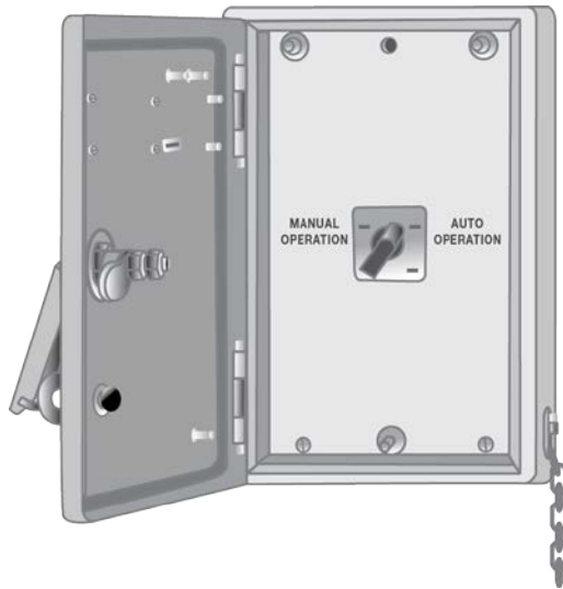
FIGURE 4: Manual Operation Switch

Manual operation switch boxes have a switch with two positions, AUTO and MANUAL . When this switch is set to MANUAL it activates all warning equipment.