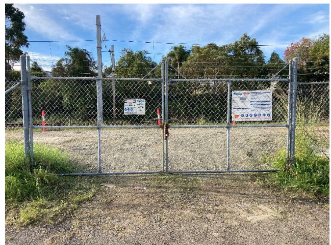
Image 2: Sensor access gate N00 154.414 U