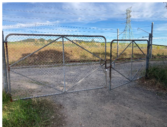
Image 2: Sensor access gate N00 151.512 D