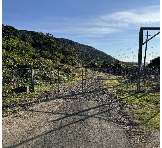
Image 2: Sensor access using access gate 100 62.460 U