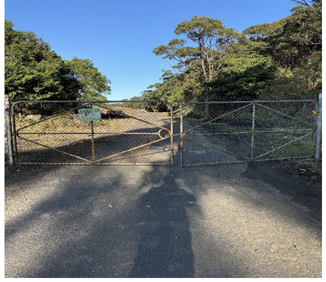
Image 2: Sensor access using access gate 100 63.183 U