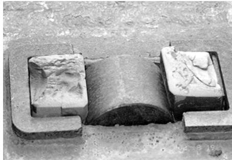
Figure 3: Constant contact side bearers with melted plastic blocks