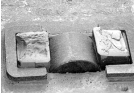
Figure 3: Constant contact side bearers with melted plastic blocks