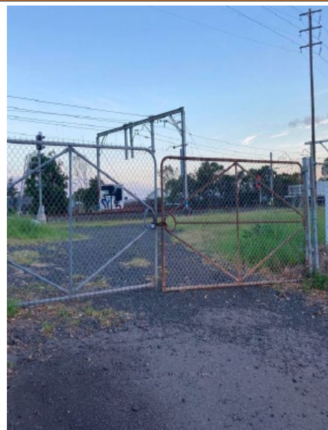
Image 2: Sensor access gate N00 16.482 U