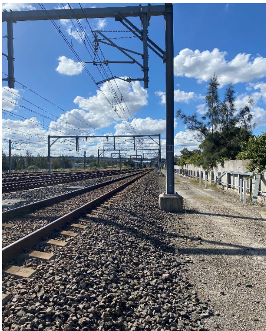
Image 1 View of worksite towards Casula station

If the ASB is required to be suspended, the Protection Officer must make sure all workers and equipment are clear of the Danger Zone and are in a safe place before suspending the ASB.