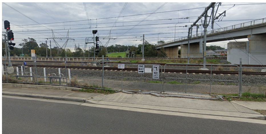
Image 3: access gate M25 32.191 D