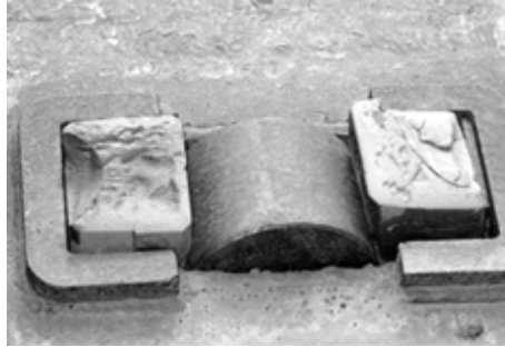
Figure 3: Constant contact side bearers with melted plastic blocks