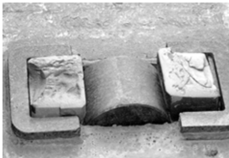
Figure 3: Constant contact side bearers with melted plastic blocks