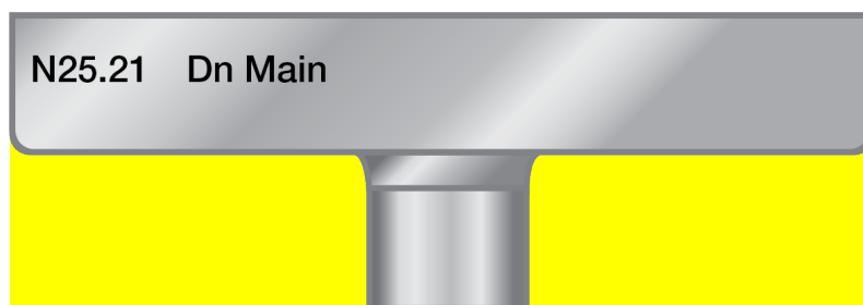
FIGURE 2: Example of key with inscribed details

The key is inscribed with the identifying number of the signal and the line to which it applies.