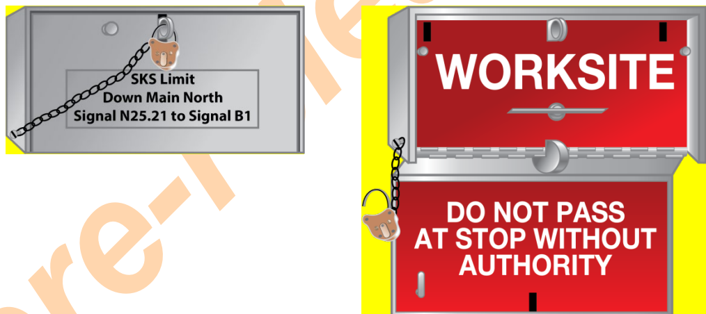
FIGURE 1: Dedicated box in the closed and open position

The key is inscribed with the identifying number of the signal and the line to which it applies.