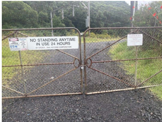
Image 1. Worksite Access City Side of Coalcliff Station (Gate: 100 58.686 D)