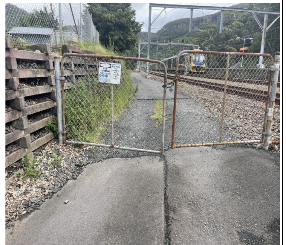
Image 2. Worksite Access Country side of Coalcliff Station (Gate: 100 59.307D)