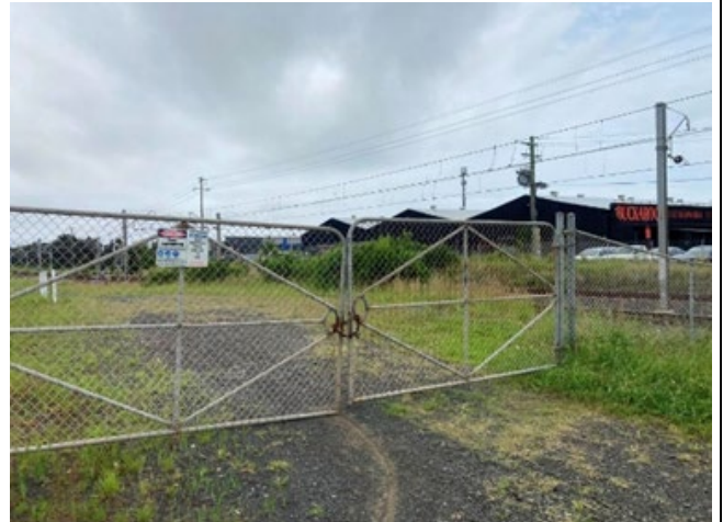
Image 2: Sensor access using access gate 100 75.400 U