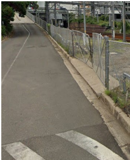
Image 5: Access gate (100 15.037 U) opposite Hurstville Substation