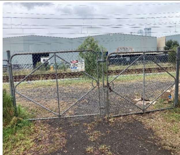
Image 2: Sensor access using access gate S00 46.947 D