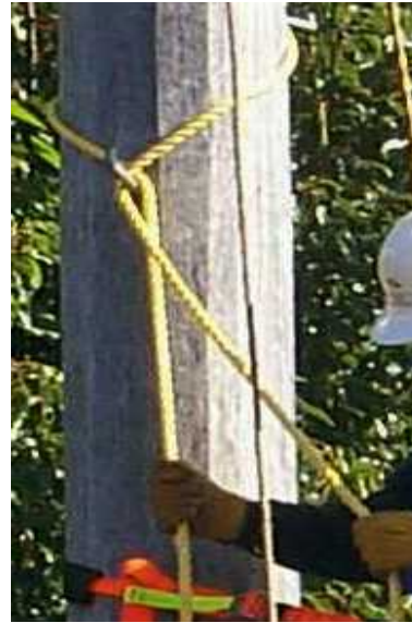
Figure 6: Rescue rope over pole step, around pole with the tail looped over first pole step