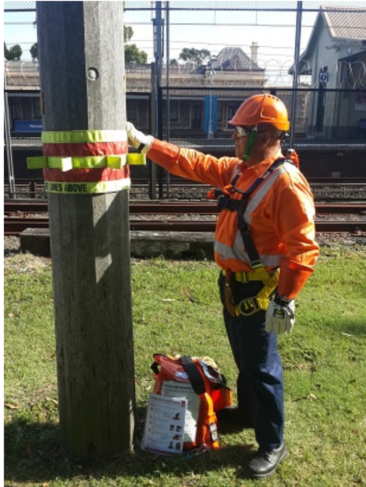
Figure 1: Accompany Person at the base of pole

When working on or passing through live low voltage conductors, an Accompanying Person shall be wearing a safety harness at all times when a worker is aloft.