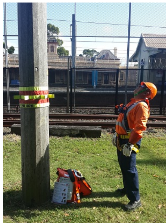
Figure 3: Accompanying Person observing with pole top rescue kit ready for use