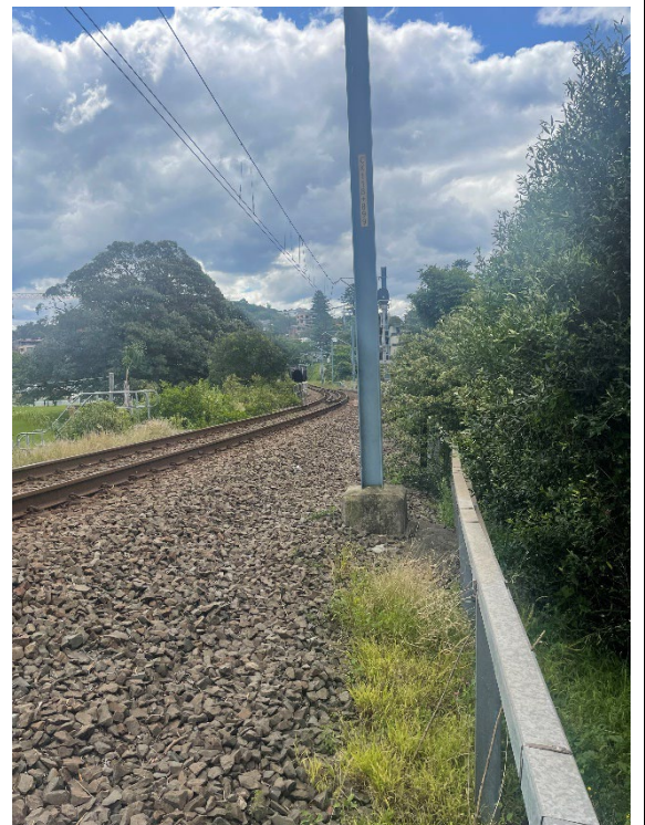
Image 4: Lookouts view from Down Cess Facing Wollongong on the Wollongong Side of 51 points