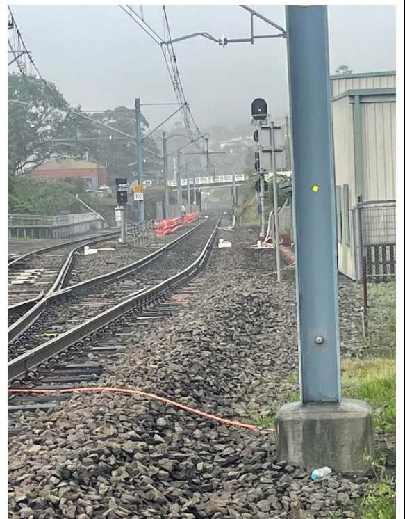
Image 6: Lookouts view from Up Cess adjacent to 54 points facing Berry