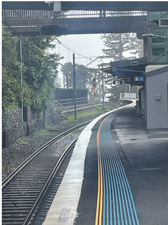
Image 1: Lookouts view from Platform 1 facing Wollongong (Workers on 52 points)