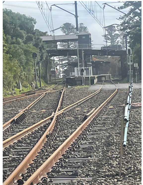
Image 2: Lookouts view from Down Cess adjacent to 53 points facing Wollongong