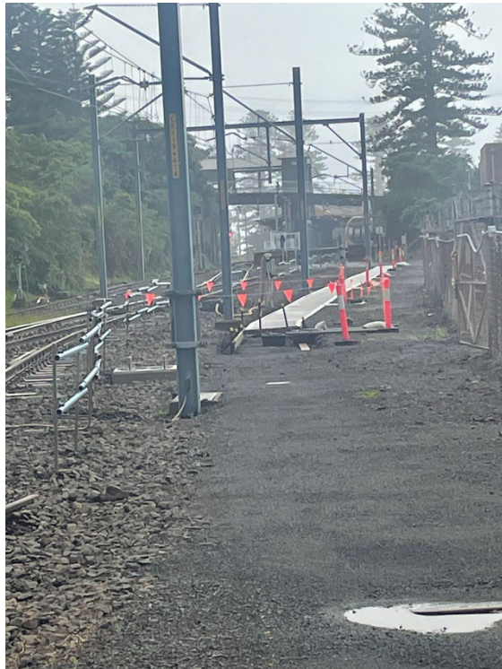
Image 3: Lookouts view from Down Cess adjacent to 54 points facing Wollongong