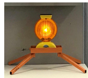
Figure 3 Approved Worksite Delineation Markers