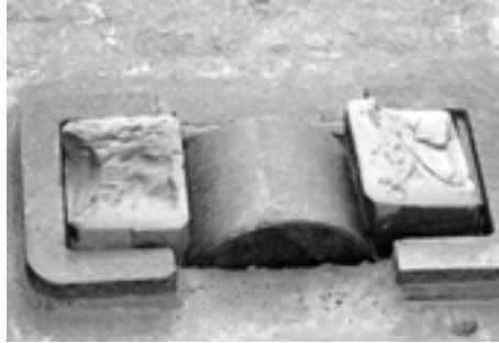
Figure 3: Constant contact side bearers with melted plastic blocks